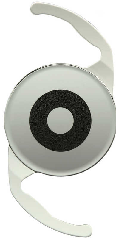
Figure 2. IC-8 single-piece hydrophobic intraocular lens with an embedded diaphragm of 3.2 mm and central aperture of 1.36 mm.

when trying to visually rehabilitate our patients with aberrated corneas and complex anterior segment problems.